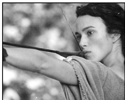
In 'King Arthur,' the aptly named Kiera Knightley stars as Guinevere, who is no longer a damsel in distress but a warrior princess.

White Chicks (PG-13): It's a gender-bending, race-skewing good time when two black male FBI agents dress up as a pair of white female socialite sisters. Expect lots of jokes with a gay edge. (QQ: mild)